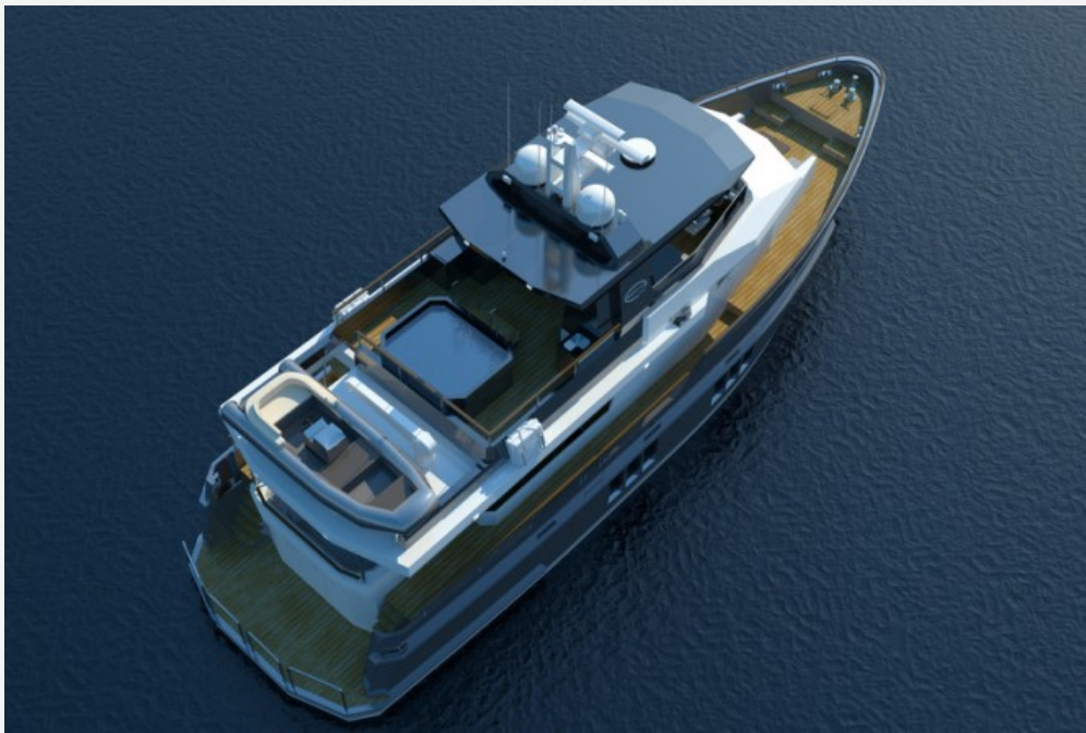
Luxury yacht Bering 75 - Top View

Beyond using a proven hull design, the entire Bering line relies on a "heavy for size" approach to providing the uncommon sea-kindly motion that very few if any recreational motoryachts are capable of delivering. A carefully designed low center of gravity combined with the sheer mass of the vessel provides a reduction in roll moment and minimized pitching and pounding that so many find unpleasant. This "heavy for size" approach is well proven in the commercial marine market where vessel "weight" is really how one defines a vessel's size as opposed to length. Note that the luxury yacht Bering 75 displaces 298 000 pounds at full load which is significantly more than her competitors!