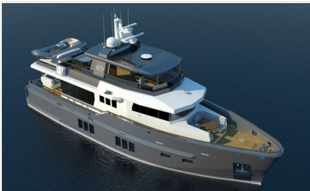
Bering 75 Yacht from above

The heavy displacement motor yacht Bering 75, whose hull form takes design comes from the proven ocean going commercial trawler, excels in the areas that matter most: a sea-kindly motion in heavy weather, reliability and ultimate seaworthiness of design.