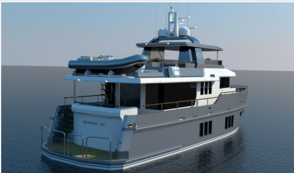
Bering 75 Yacht - aft view

While at sea, one's peace of mind is of utmost importance, which is why in addition to the hull & structural design Bering puts great emphasis on the reliability & durability of their motoryachts. The strict use of only commercially rated and internationally sourced equipment on board ensures you will have minimal equipment related problems, and in the rare case that you do, parts will be readily available regardless of your locale.