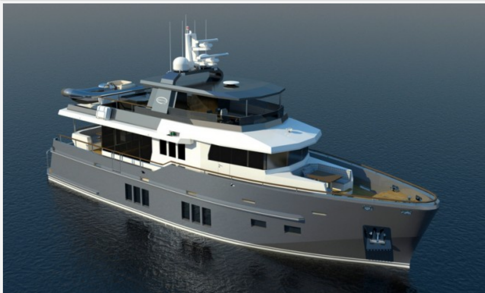
Luxury expedition yacht Bering 75 by Bering Yachts

Luxury motor yacht Bering 75 by Bering Yachts represents a flagship of the Yachtship Series of motoryachts. This series mixes up all of the seakeeping abilities of the Expedition series, while bringing a modern “contemporary” look and feel to the design. Bering 75 yacht could be rightfully classified as an “expedition yacht” given her amazing capabilities.