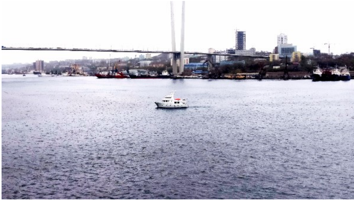
Bering 65 Serge on its way to Vladivostok